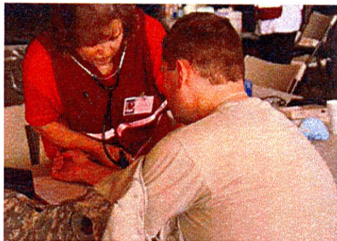
East Central GA MRC NDMS Exercise 2007

The Johnson County MRC unit is community-based and functions to locally organize and utilize volunteers. When a public health emergency occurs, the need for volunteers will be tremendous. The Johnson County MRC will be used to supplement existing emergency services when a disaster is of a magnitude that overwhelms those existing resources. Further, the Johnson County MRC volunteers can provide relief for overworked workers in the event of an emergency.