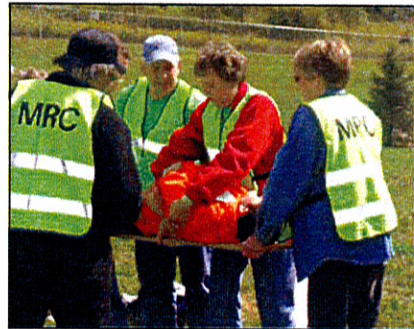
Nebraska Western Iowa MRC Fall Drill 2006